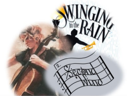
Voices of the Community

July 17, Voices of the Community: vocals by Second Wind, cello by Dace Sultanov, & Swingin' in the Rain big band. Hales Center, SWOCC. @7 pm. Tickets available now.