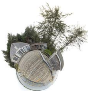
Small planet panorama OIMB Boathouse

Opportunities to Sponsor Educational Programs, Special Concerts and Festival Orchestra Musicians are available. Sponsor/Membership forms provide information. Our Festival continues only with strong support in the community from members, businesses, grants, volunteers, and in-kind donations.