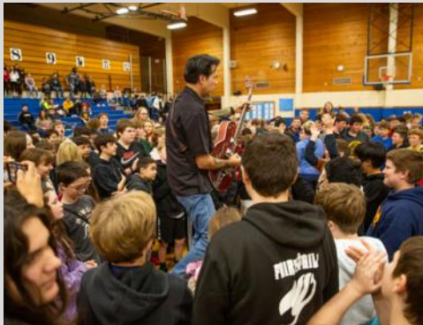
Music in the Schools — March 5—7