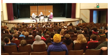
OCMA Trio performs for students in Marshfield Auditorium