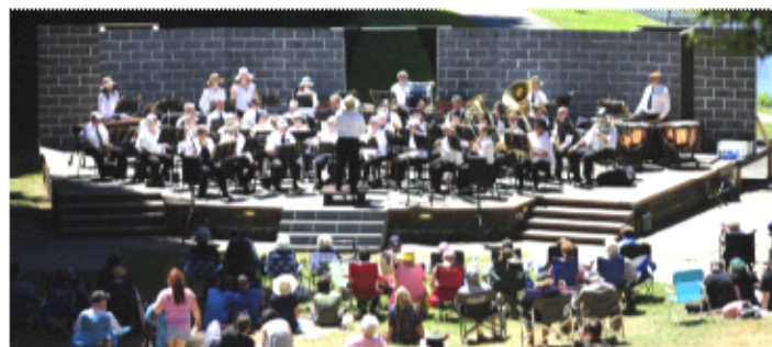
The Bay Area Concert Band Opens Our Festival Each Summer

Are you interested in helping support OCMA with bequests or festival sponsorship? Contact our office in person or via email or telephone for details.