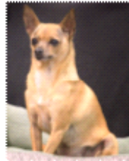
OCMA Festival Mascot Carlos waits proudly in the Green Room